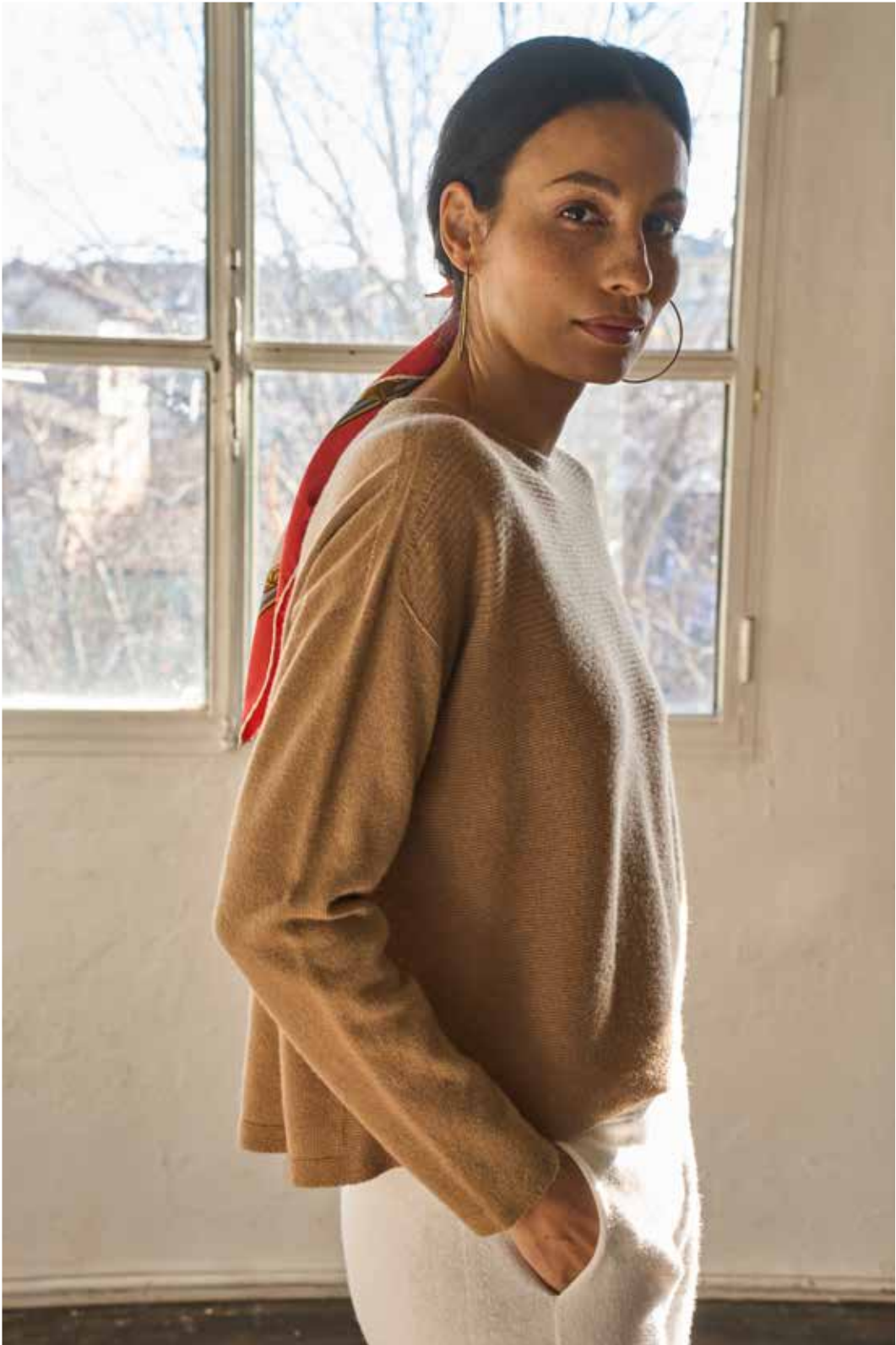
Round neck sweater- LB624024