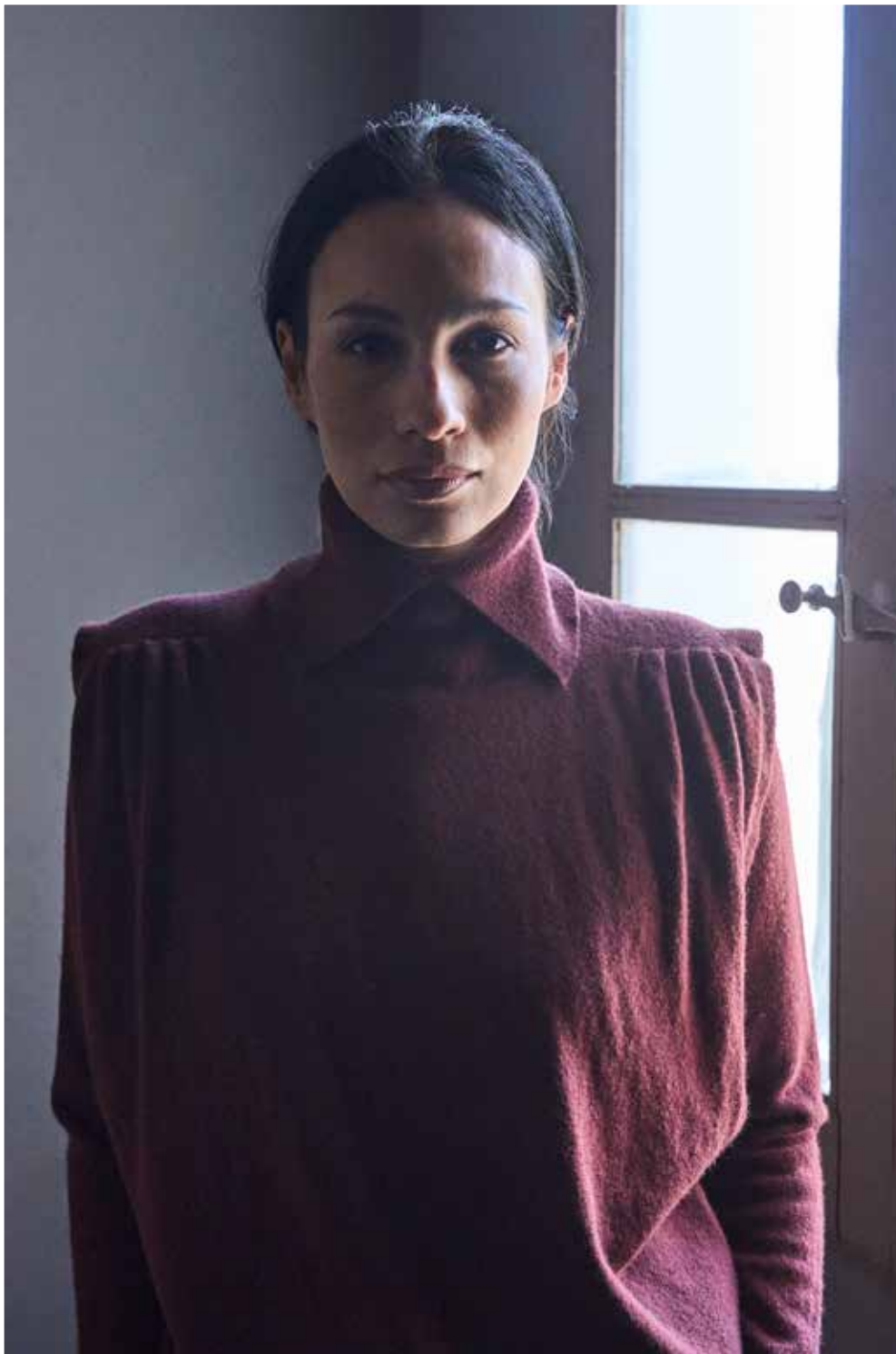
Gilet with collar LB624053