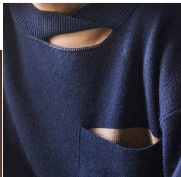
Round cross neck sweater