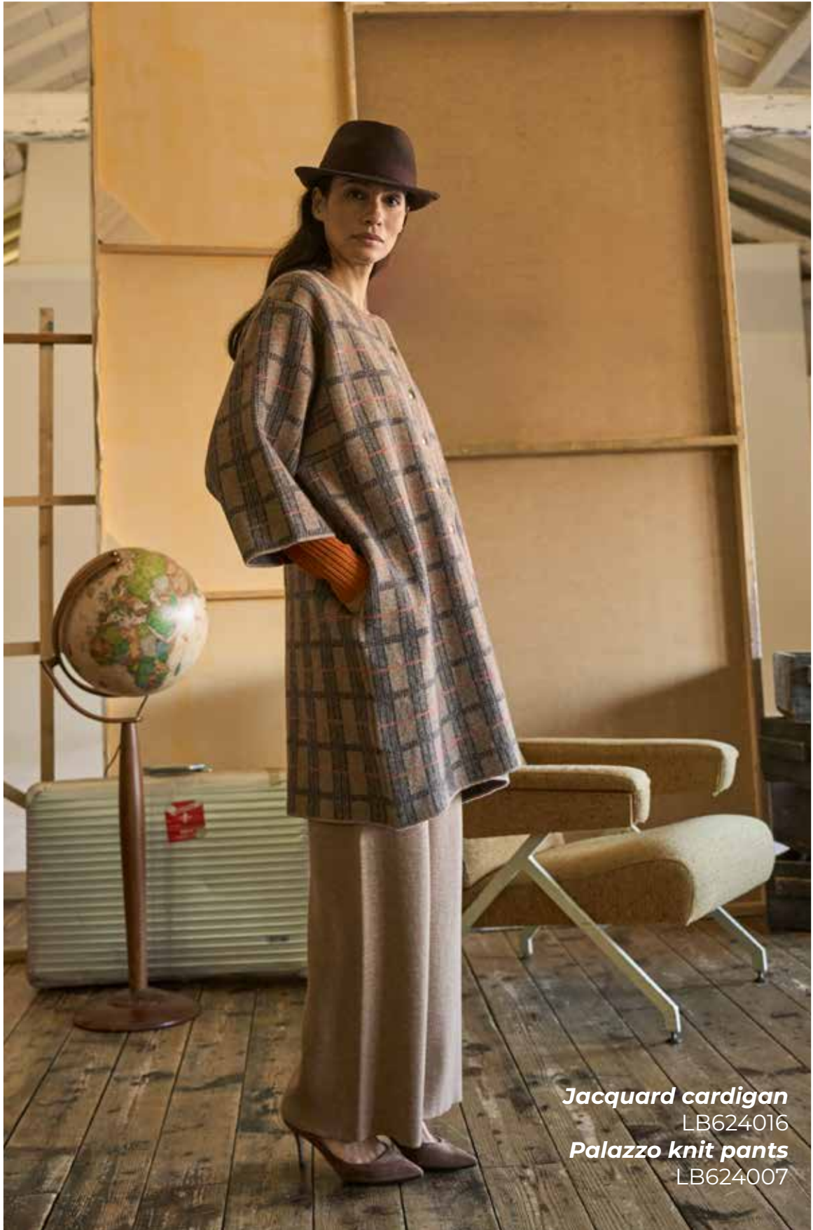
Jacquard cardigan LB624016 Palazzo knit pants LB624007