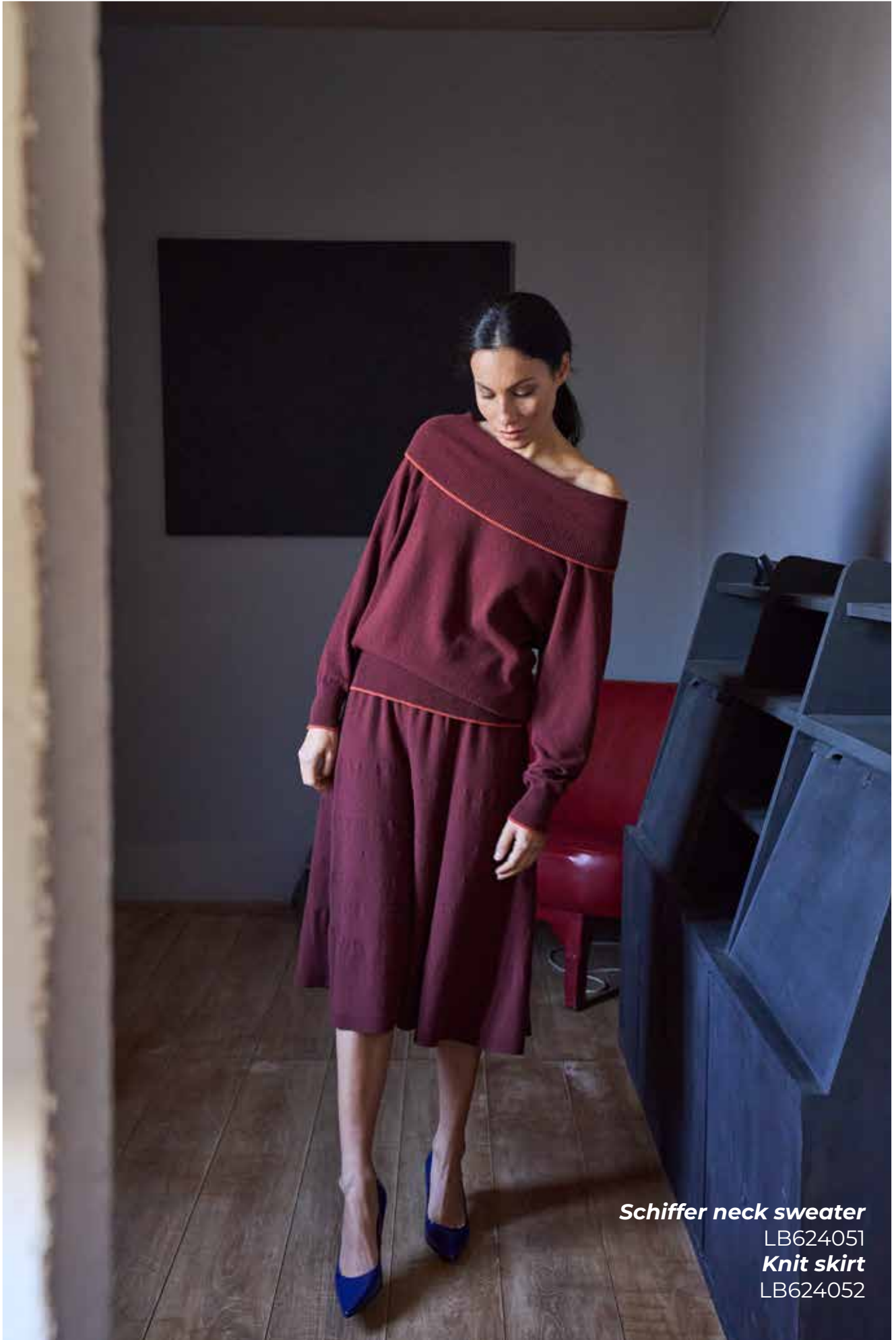
Schiffer neck sweater LB624051 Knit skirt LB624052