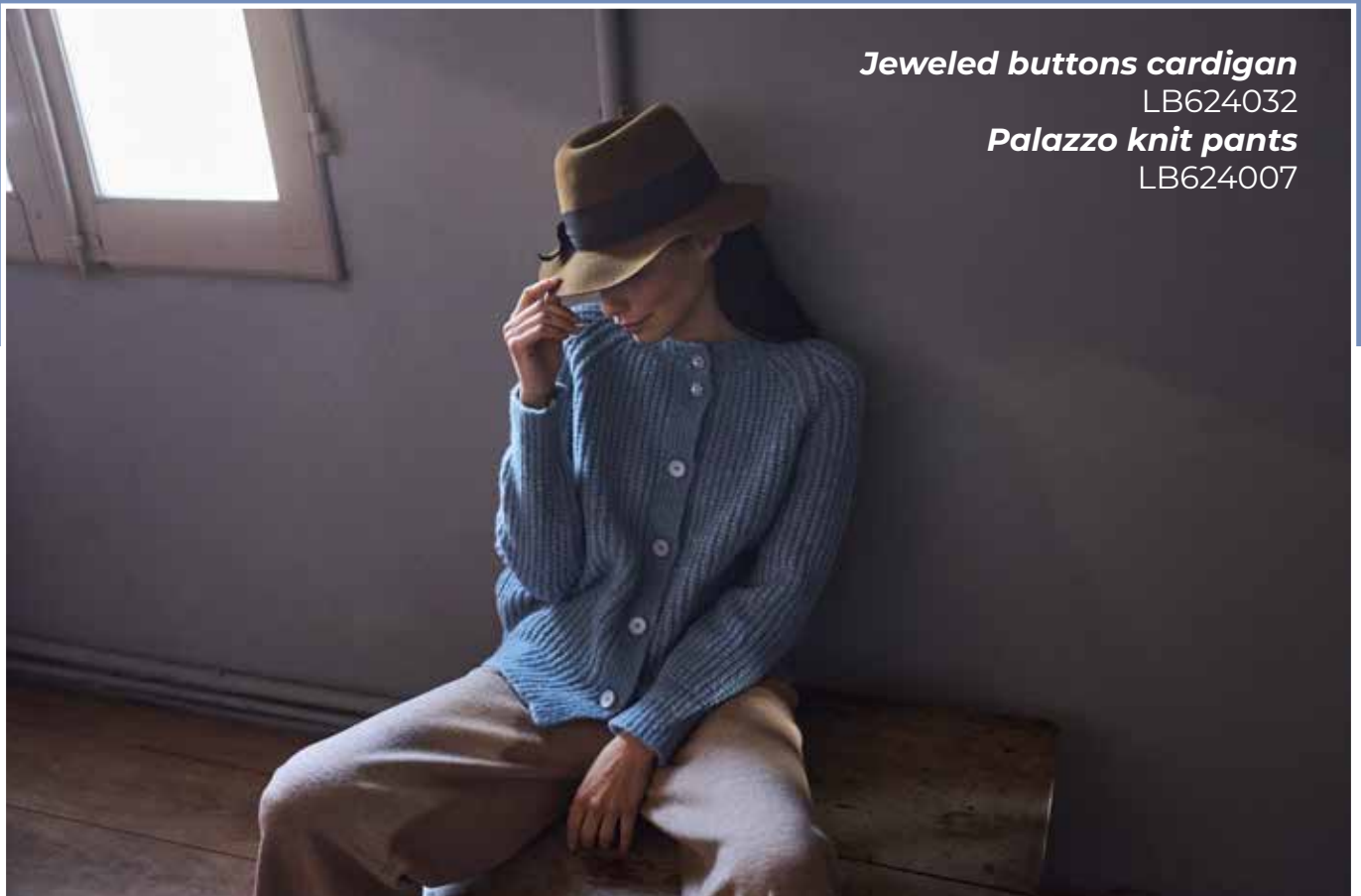
Jeweled buttons cardigan LB624032 Palazzo knit pants LB624007