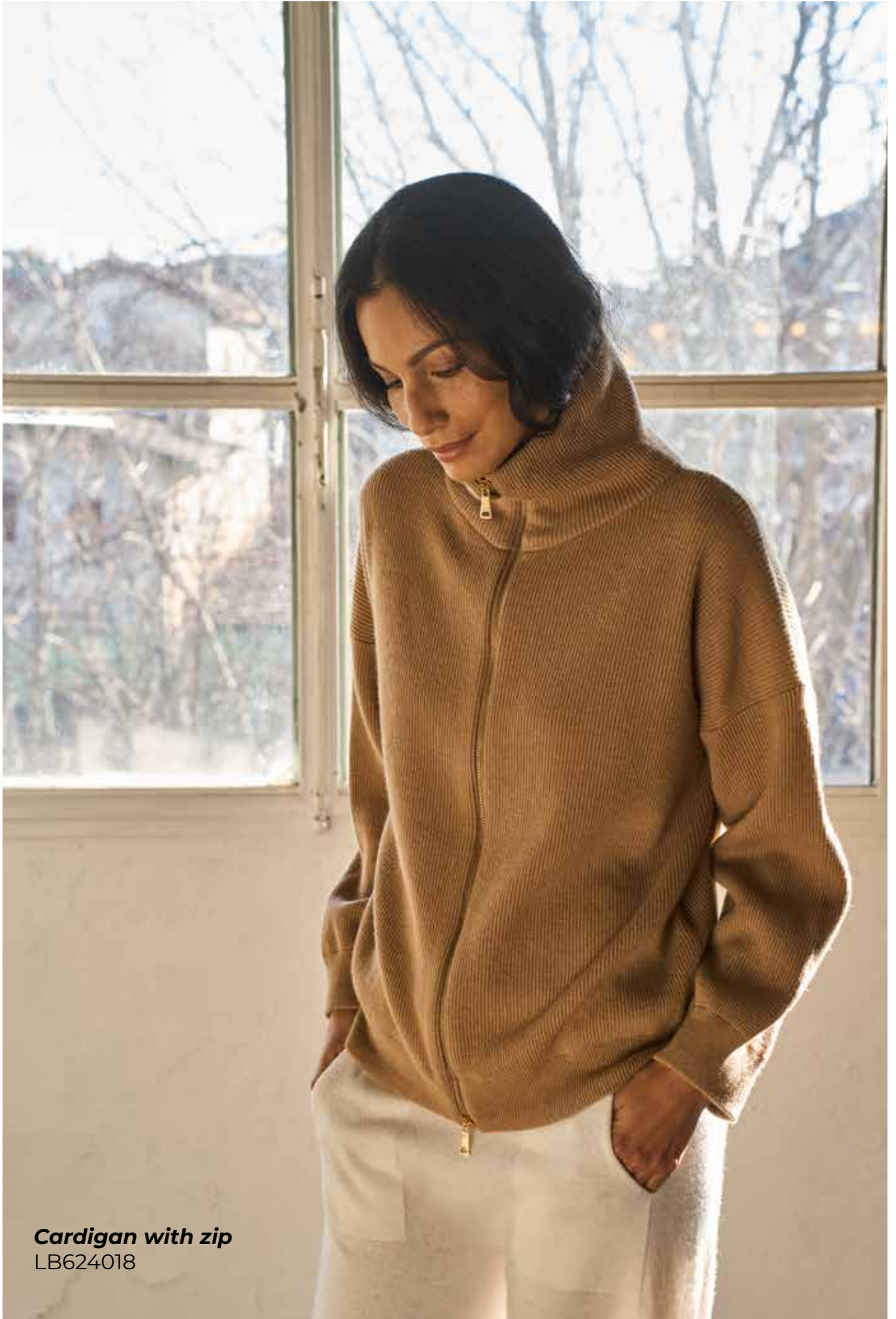
Cardigan with zip LB624018