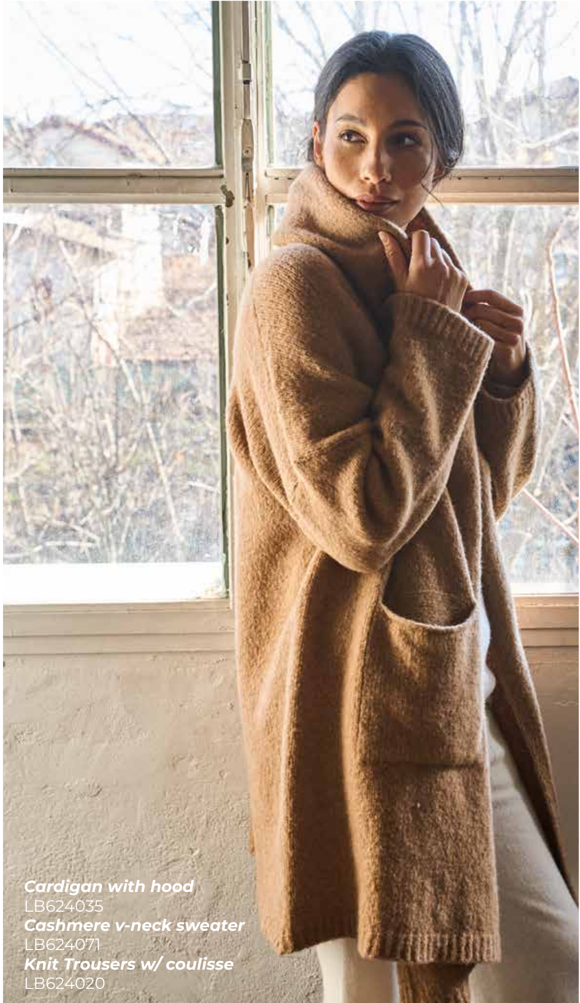
Cardigan with hood LB624035 Cashmere v-neck sweater LB624071 Knit Trousers w/ coulisse LB624020