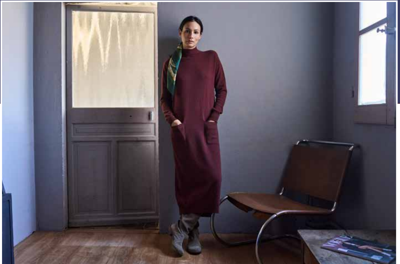
Long dress LB624021