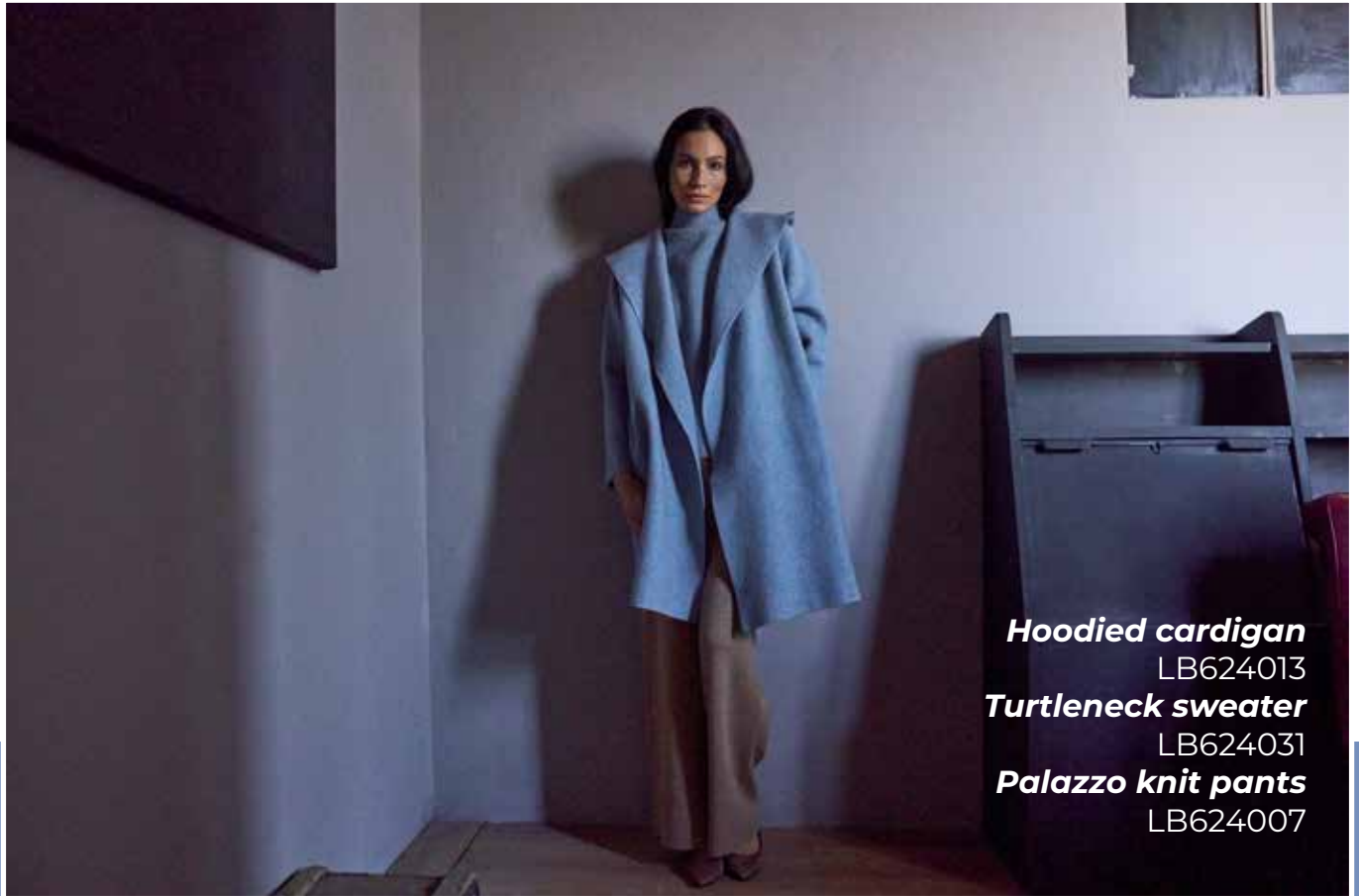
Hoodied cardigan LB624013 Turtleneck sweater LB624031 Palazzo knit pants LB624007